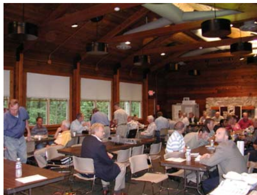
SWCS Members gathered at the Lodge